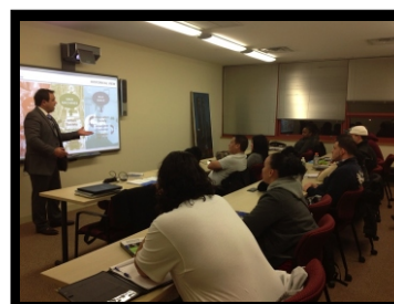
NJCU, lecture on "Major Events".